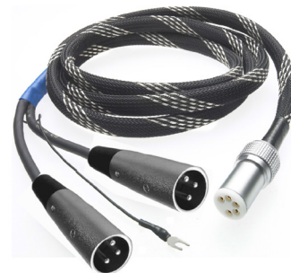
Connect it Phono DS 5P/XLR: separately available upgrade cable for True Balanced phono connections

The X8 ships with a semi-balanced Connect it E 5P -RCA cable and the Sumiko Moonstone, a moving magnet cartridge. When upgrading to a Moving Coil cartridge, by incorporating our fully balanced 5P to XLR connecting cable (available separately) and using a balanced phono stage, (like our Phono Box S3 B, Phono Box DS3 B or the RS/RS2 phono stages, you are fully set-up for the True Balanced experience. This dramatically improves the signal to noise ratio, minimizing susceptibility to noise and hum, and preserving recorded dynamics .