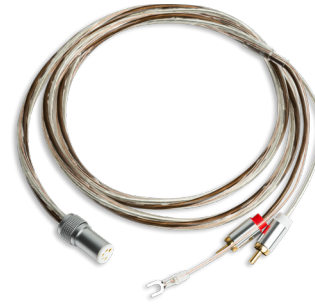
Connect it Phono E 5P/RCA included: Semi-balanced premium phono cable

The 9cc EVO carbon tonearm utilizes inverted cardanic tonearm bearings, has four stainless steel tips mounted in ABEC 7 quality ball bearings mounted in a C-shaped section to minimize resonances. The low mass one-piece carbon fiber tonearm tube is crafted in a conical shape to minimize standing wave vibrations. The tonearm wire loom is one piece, from the cartridge to the 5pin DIN output, designed to allow either single ended or True Balanced phono connection.